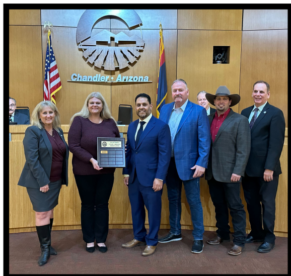
Pictured left: AATN presenting The Chandler City Council with a plaque honoring their CEASE Certification and dedication to fighting human trafficking and exploitation