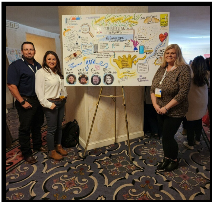
Pictured Left: AATN Staff and a law enforcement partner stand next to a visual of their presentation at the 2023 JUST Conference