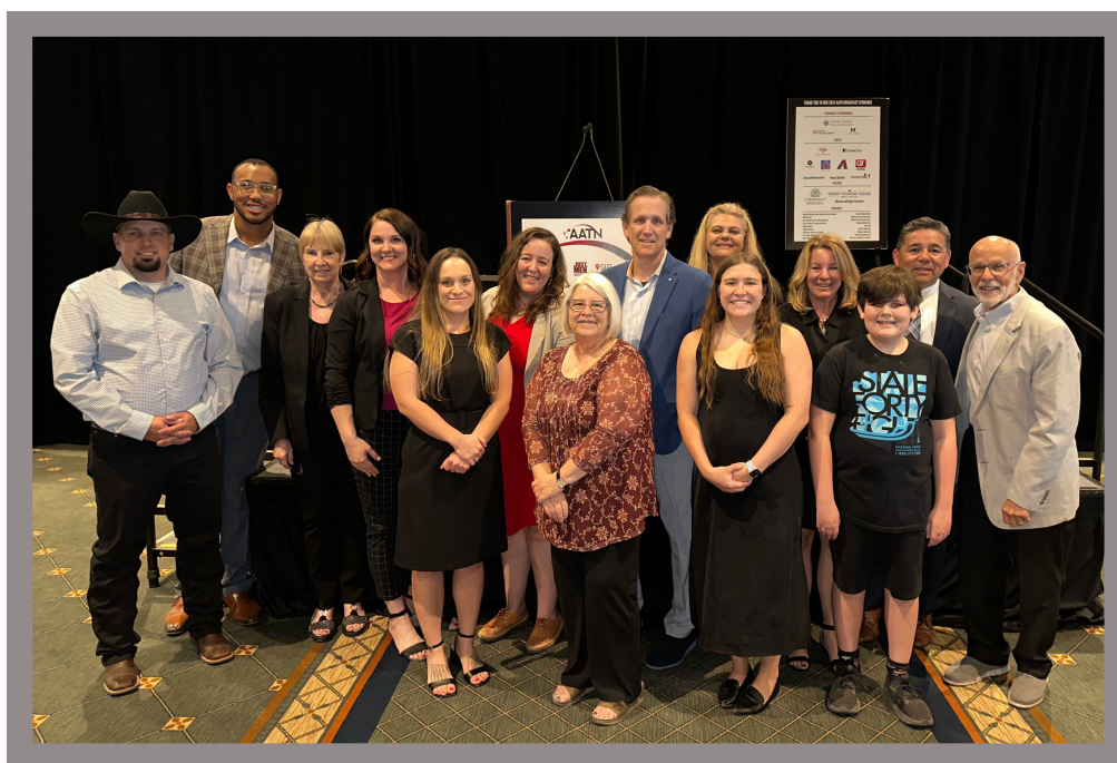
Pictured above AATN employees and board members after our 2023 Breakfast

2023 was another successful year for the Arizona Anti-Trafficking Network (AATN)! During this period, AATN expanded significantly in both size and capability, working to foster an Arizona where no one is bought, sold, or exploited. Our gratitude extends to the individuals and organizations who dedicated their time to our mission, actively participating in the ongoing battle against human trafficking within Arizona's communities. Your commitment is instrumental in our collective efforts, and we appreciate your support.